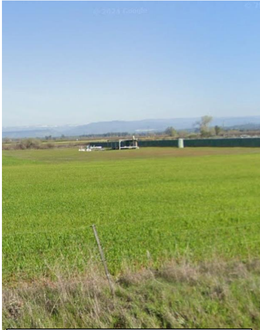
Palermo Grass Field, 943 Cox Ln, Oroville, CA