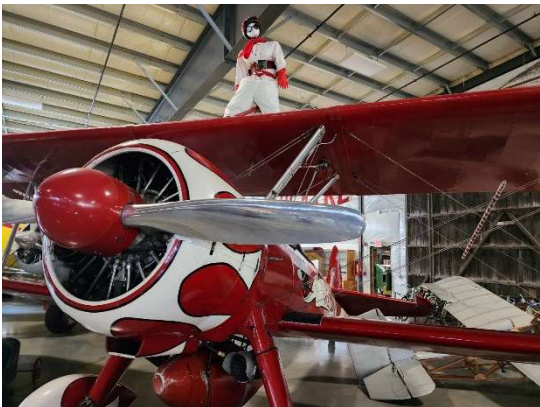
Back Page WAAAM photos.

Eds. Note. Not responsible for omissions, errors or typos.